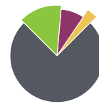
Grades of Essential Oils

doTERRA® sets a new standard for purity with CPTG® in response to unregulated essential oil standards that limit usage and benefits.